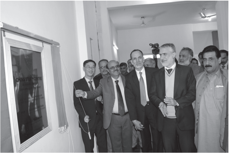
H.E. the Chinese Ambassador Yao Jing at the memorial plaque along Vice Chancellor UoP at China Study Centre.

Answering a question about the connection of CPEC and China study center, He further added that this