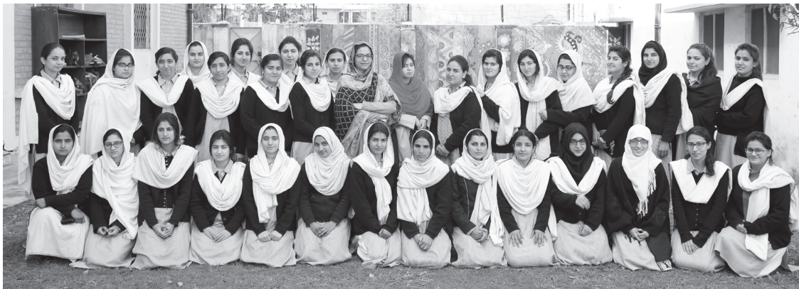
Participants of one Day Workshop Workplace Psychology at CHE.

Some 18 teams participated in the final round of tournament on knockout basis at University of Peshawar campus.